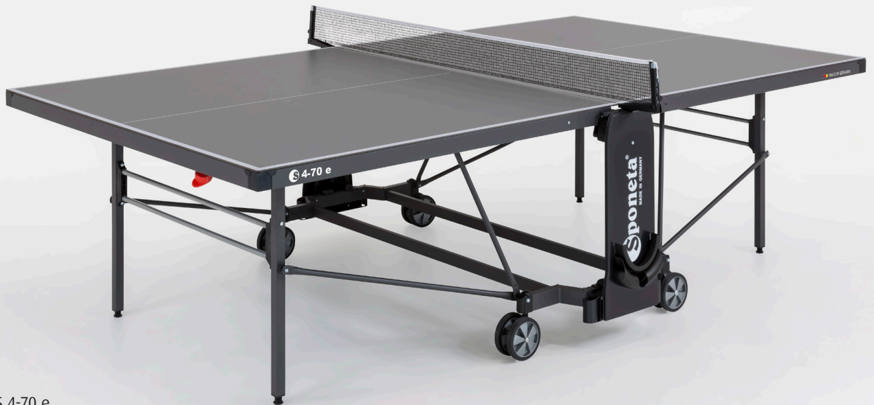
S 4-70 e