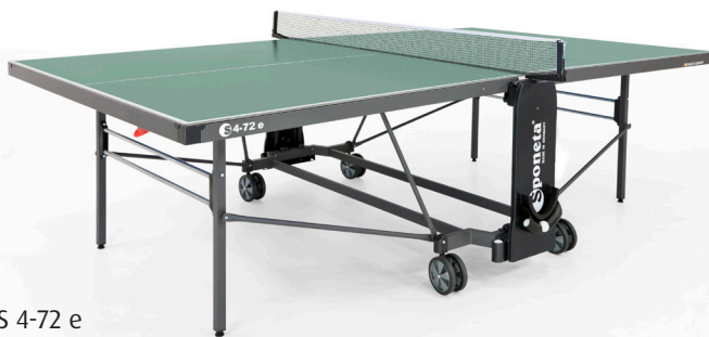
S 4-72 e