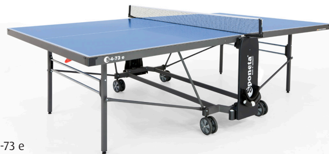
S 4-73 e