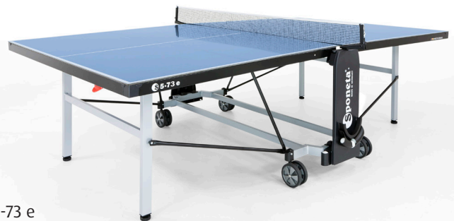
S 5-73 e