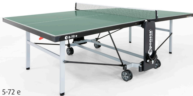
S 5-72 e